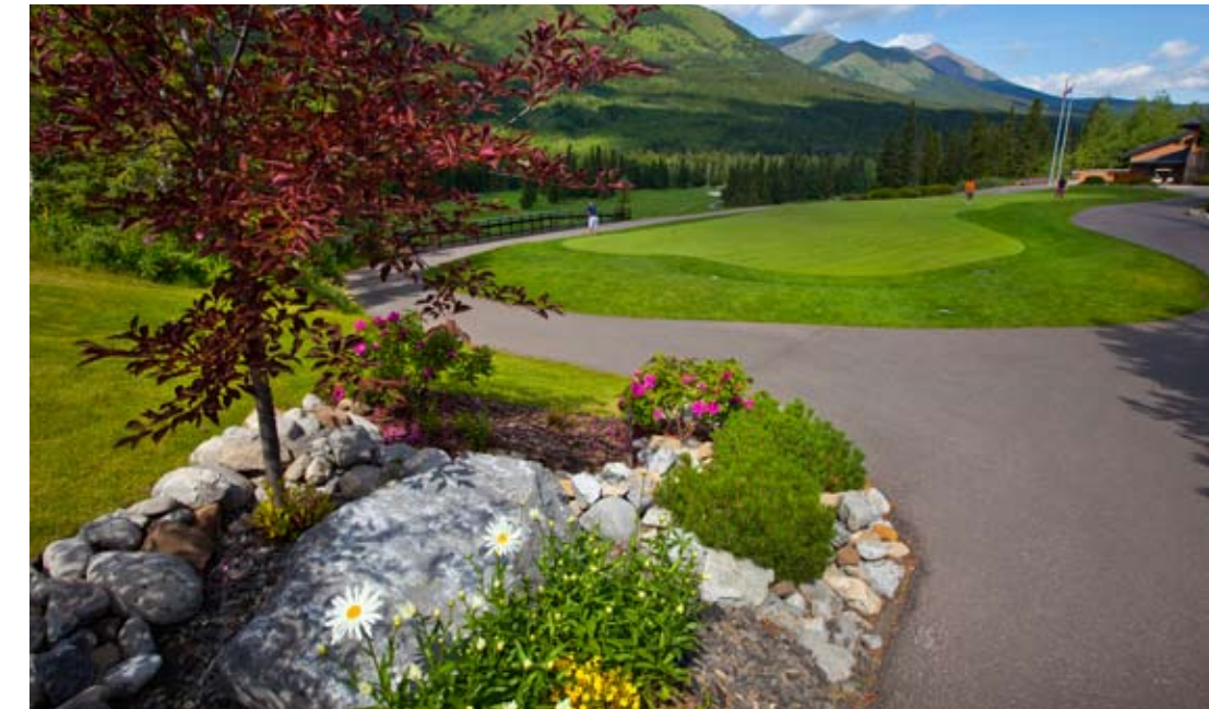
Both G8 photographs by Diane Murphy of the Office of the Prime Minister of Canada, courtesy of Kananaskis Country Golf Course.