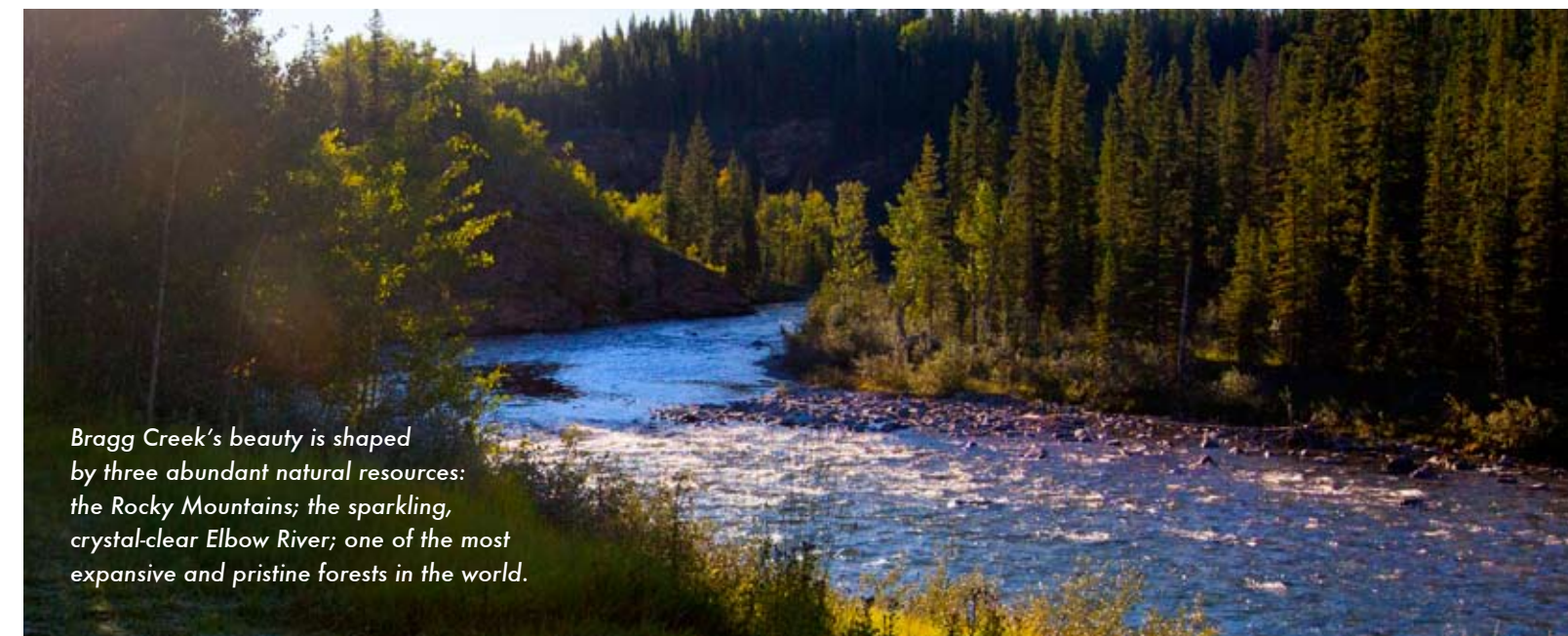
Bragg Creek's beauty is shaped by three abundant natural resources: the Rocky Mountains; the sparkling, crystal-clear Elbow River; one of the most expansive and pristine forests in the world.